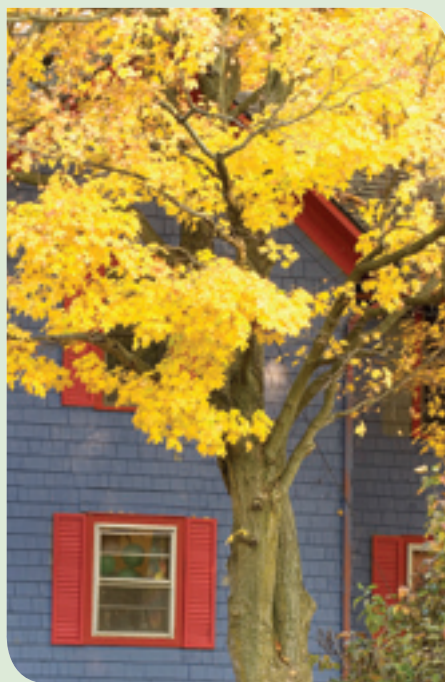
Well-placed trees can help homeowners save energy by shading their homes.

More information about tree care and the benefits of planting trees is available on the Arbor Day Foundation website ( http://www.arborday.org ).