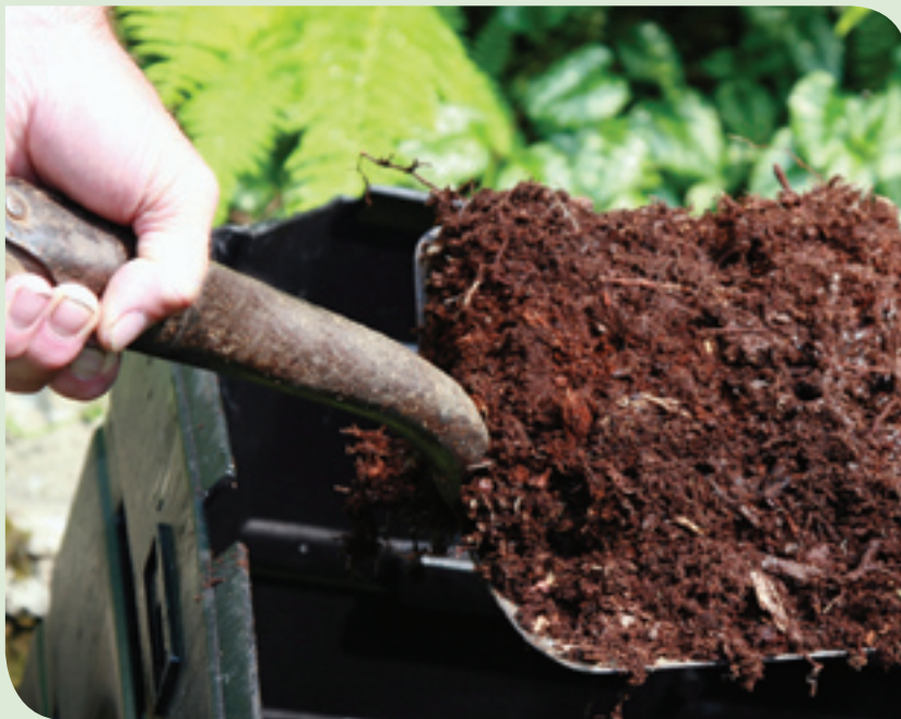
Turning garden and kitchen waste into compost reduces heat-trapping methane emissions from landfills, improves your garden’s soil, and helps it store carbon.

To read more about the science of composting and tips for choosing a system appropriate for your yard, visit the University of Illinois Extension website ( http://web.extension.illinois.edu/homecompost/intro.html ).